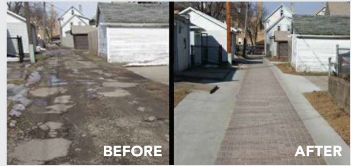
Sample location in Dubuque Iowa showing before and after benefits