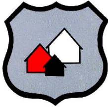
The Crime Free Multi-Housing Program